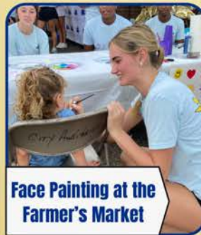
Face Painting at the Farmer's Market