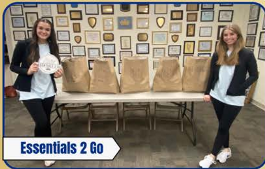
Essentials 2 Go