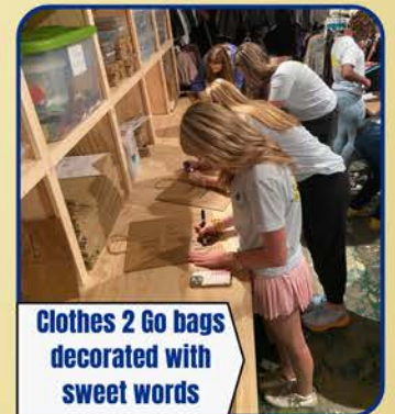
Clothes 2 Go bags decorated with sweet words

JA of Columbus has established a one-time scholarship in the amount of $1,000 to be given to a graduating senior who was a member of JA of Columbus Crown Club.